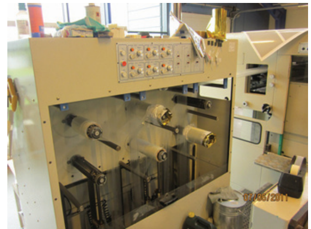
Free standing rewriter with 6 tension axles